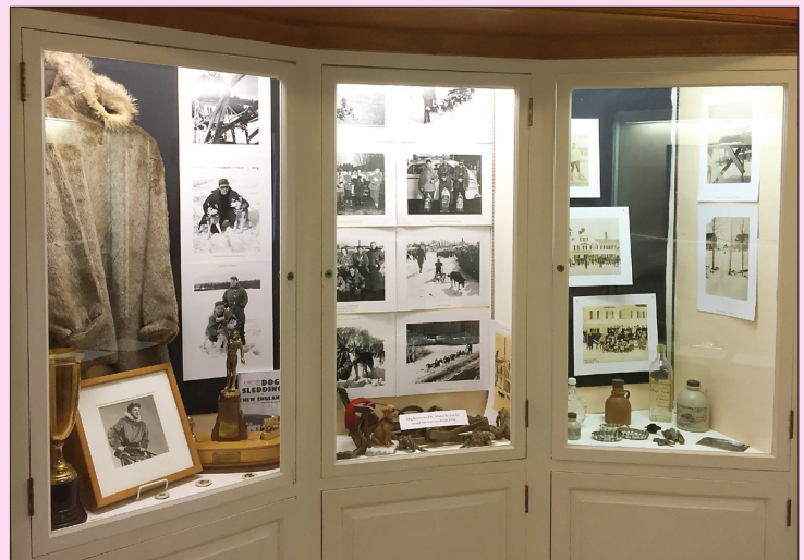
We combined two related themes in our February exhibit at the Civic Center: Jaffrey's connection to dog sled racing back in the 1940s and 50s and Winter Scenes, particularly ones associated with the annual Jaffrey Winter Carnival.