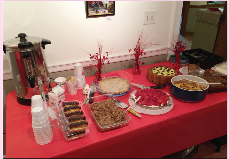
Time for dessert at the Society's annual Potluck in February.