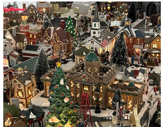
The JHS Christmas Village on display at the Civic Center this past season.

This year's Annual Christmas Village brought in hundreds of people from across the region to see the enlarged village of Piscaquoddymoggin, NH. The display lasted from November 19-December 20. Although technical issues made the train inoperable, the vast majority of visitors enjoyed the display and said they were looking forward to next year. This brought much needed publicity to the Society.