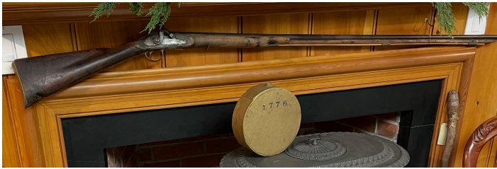
The Boynton musket and canteen.