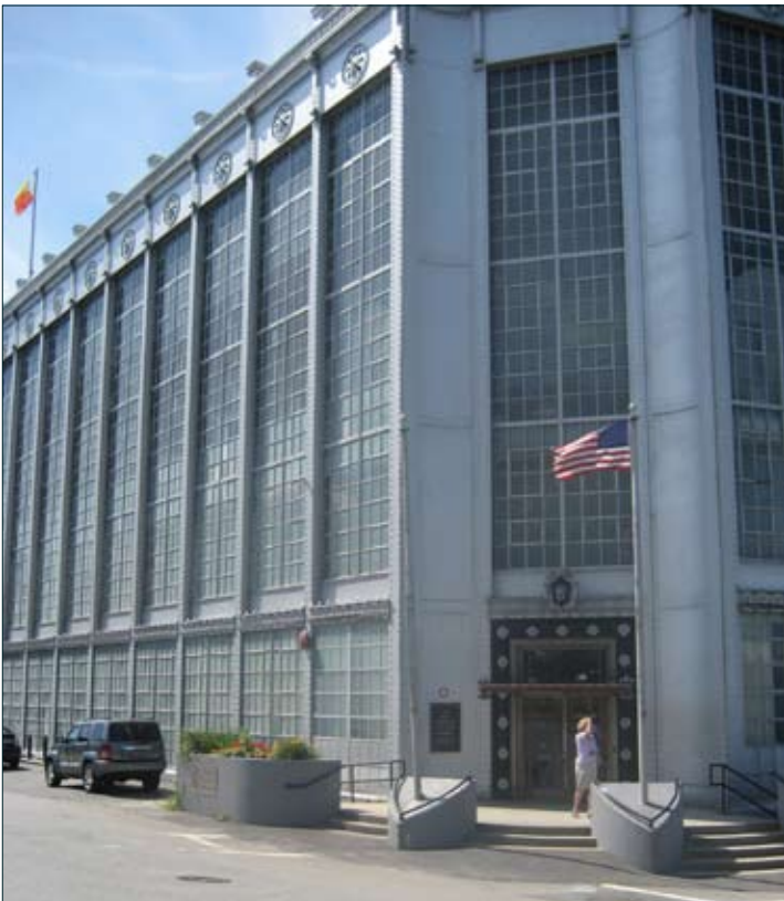
The distinctive art-deco facade of the Higgins Armory Museum.