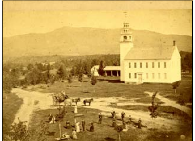
The Meetinghouse from Cutter's Hotel. The Hearse House is shown at the end of the Horsesheds. The Society is now investigating building a new Hearse House to house and display our two historic hearses.